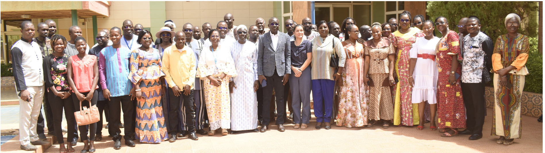
The Secretary General of the Ministry of Health and Public Hygiene, representatives of departments, and technical and funding partners pose for a photo after the technical validation of the National Community Health Strategy in Ouagadougou.