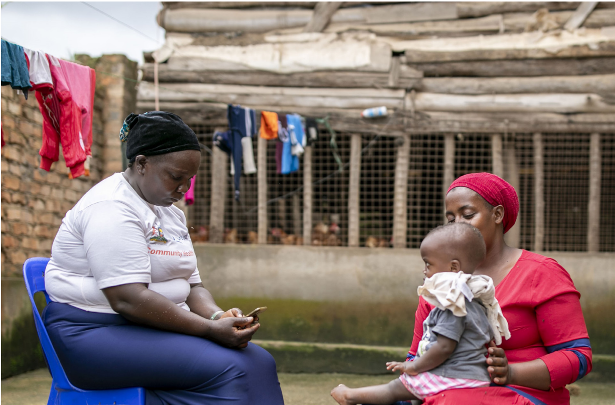
A CHW in Masaka District inputs a child's information in the phone during a household visit.

Additionally, we implemented a robust change management process led by our Uganda leadership team and supported by an external consultant. This process included various feedback channels and ensured timely, fair, and transparent communication with staff. Of the 69 staff members who transitioned out of Living Goods, each received support including career and finance counseling, psychosocial support, and redundancy packages meeting full legal requirements. ■