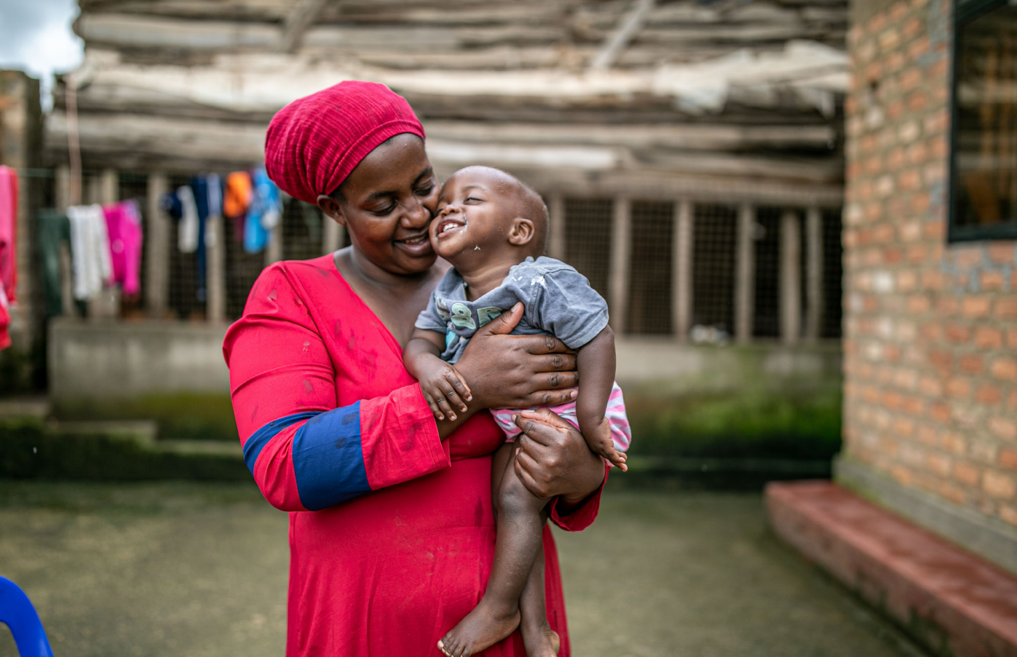
Uganda: A light-hearted moment between a mother and her child.

In all we do, we seek to live out our core values: