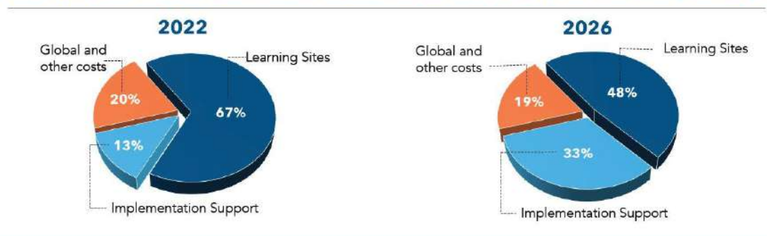
Shift Over Time in Levels of Investment across Different Modes of Support (cost to Living Goods only)