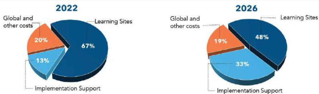
Shift Over Time in Levels of Investment across Different Modes of Support (cost to Living Goods only)