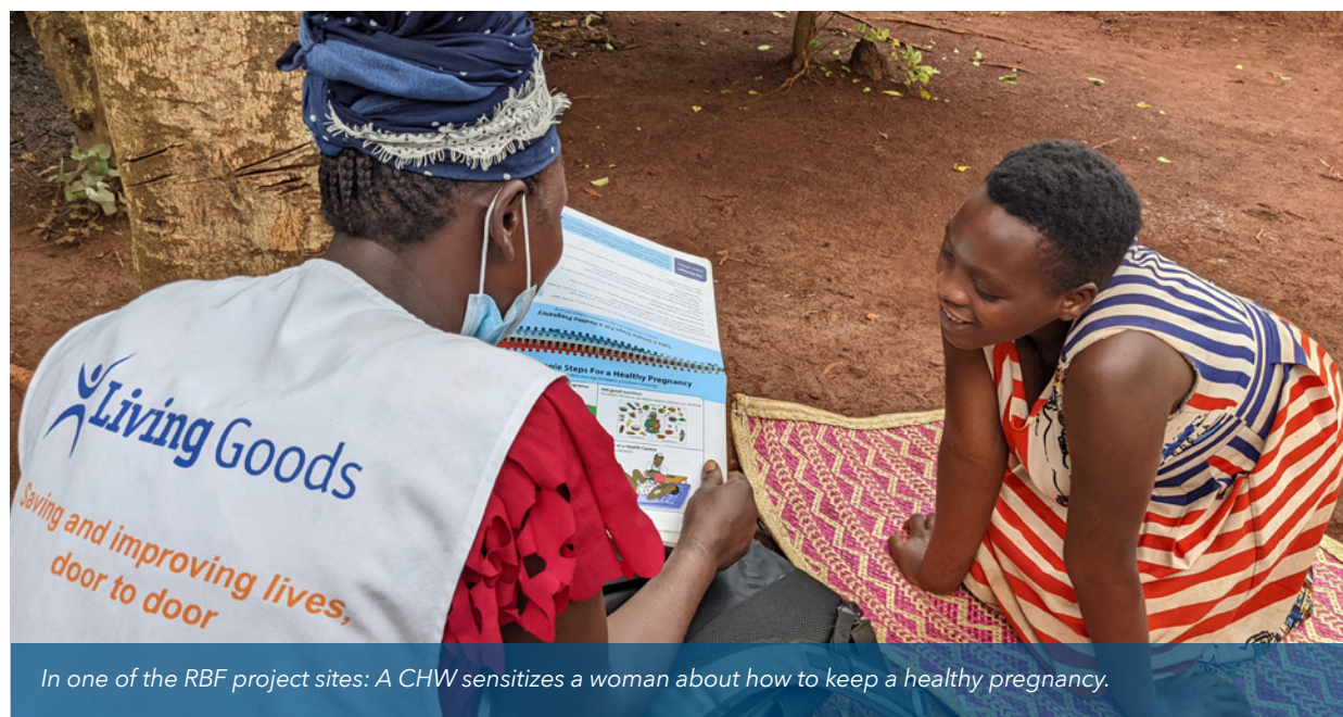
In one of the RBF project sites: A CHW sensitizes a woman about how to keep a healthy pregnancy.

To learn more about this RBF project and our learnings, you can access the final report here .