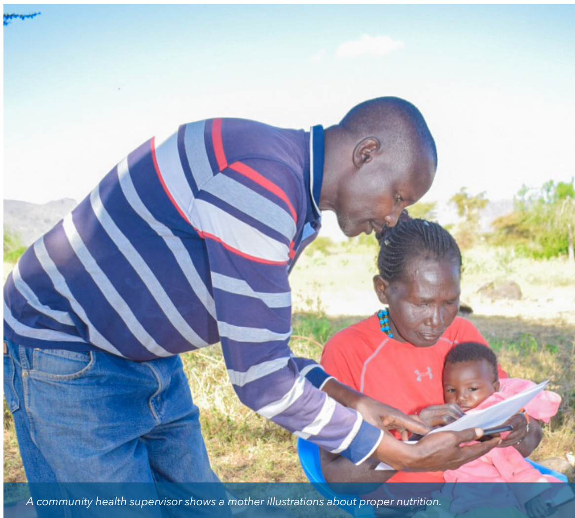
A community health supervisor shows a mother illustrations about proper nutrition.

Amidst the challenges, a silver lining is the notable increase in immunization rates. In Q2, 94% of the children 9-23 months assessed by CHWs were fully immunized, versus 88% in the same period last year. ■