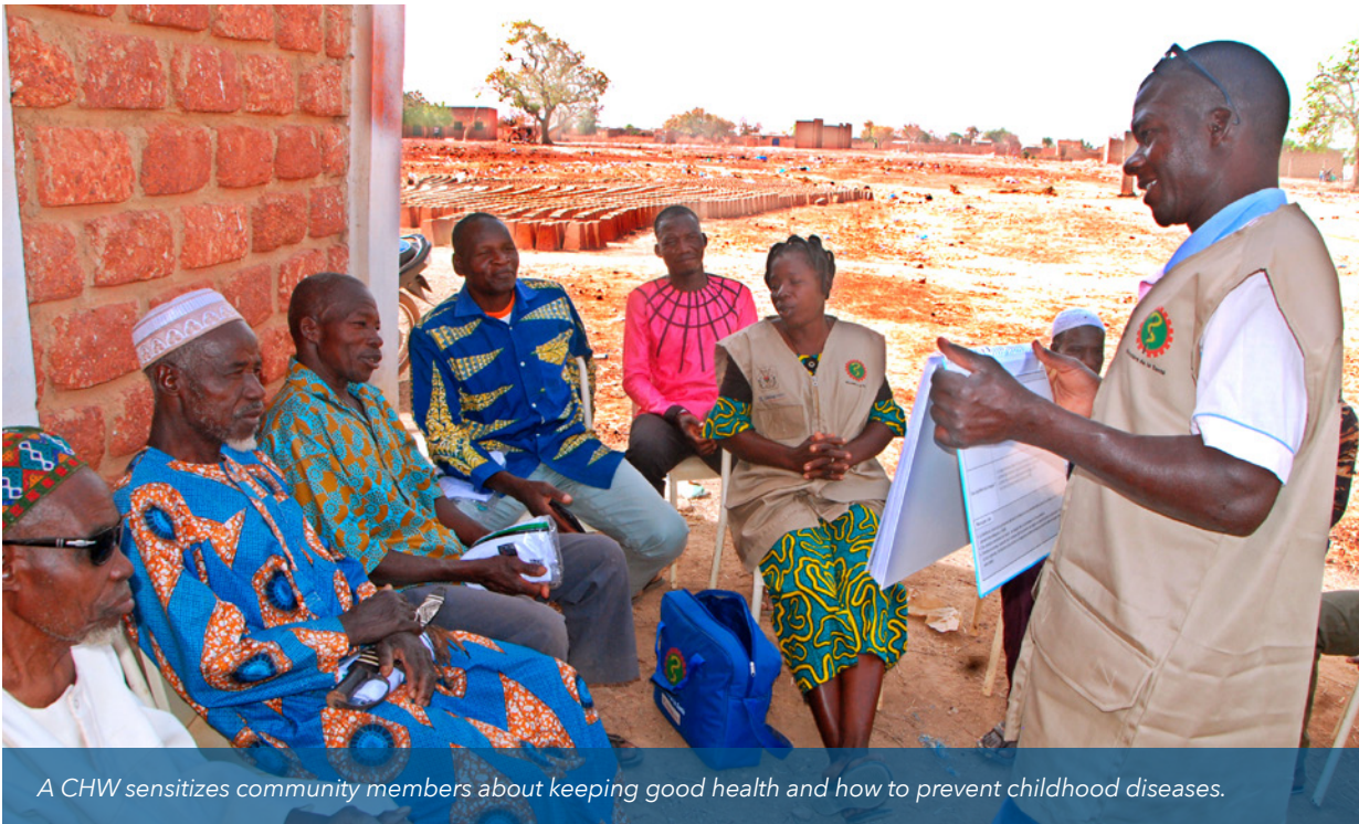
A CHW sensitizes community members about keeping good health and how to prevent childhood diseases.

That said, issues with data flow and syncing of CHWs' digital tools mean that not all data is yet being reported. CHWs are currently manually reporting, which likely understates results. We are working with the MoH and digital partners to address this, but there have been delays in part due to the recent government personnel shifts. We will be seconding staff to support the government digital teams in the in the next quarter. ■