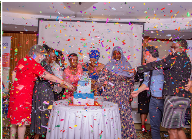
Photos from the 15 year celebrations in Uganda.