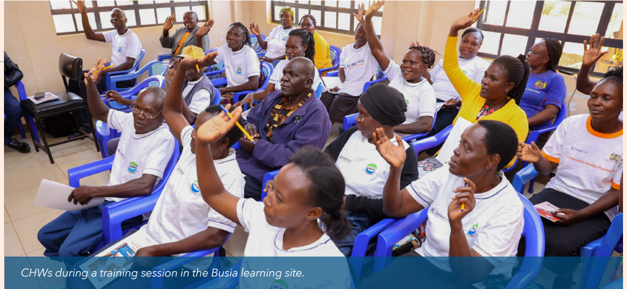
CHWs during a training session in the Busia learning site.

family planning. We are also conducting continuous capacity building programs for staff and CHWs on family planning indicators.