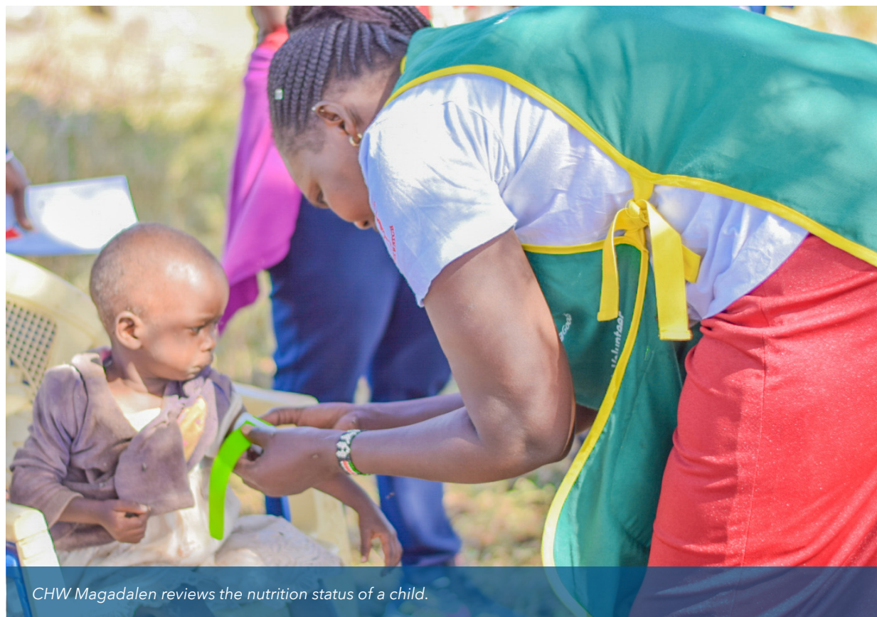
CHW Magadalen reviews the nutrition status of a child.

Another third of CHWs switched to manual reporting during the quarter due to dysfunctional phones. Although digital tools are the county