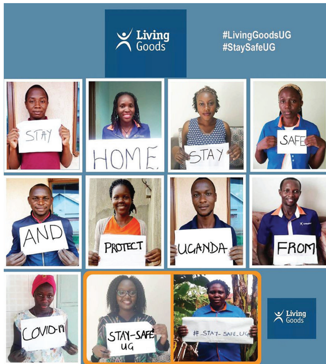
Living Goods staff in Uganda motivating each other and the communities we serve to stay home and stay safe.

Additionally, in Uganda, Living Goods supported the MOH in thinking beyond the health facility to include CHWs in their PPE projections. Previously, the MOH used to procure PPE with support from the WHO system, but is now using the Africa CDC portal, which requires governments to set national priorities. Along with other partners, including UNFPA, we were able to influence MOH to ensure a line item for CHW PPE and provided technical support to assist with forecasting and procurement.