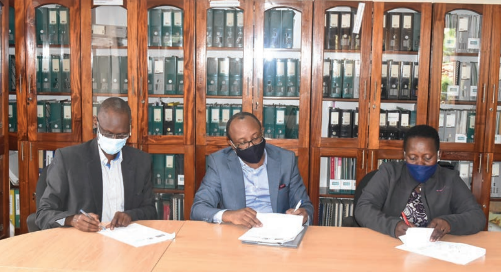
The signing of an MOU for co-financed TA in Uganda's Oyam district, through which Living Goods will focus on mHealth and data-driven performance management.