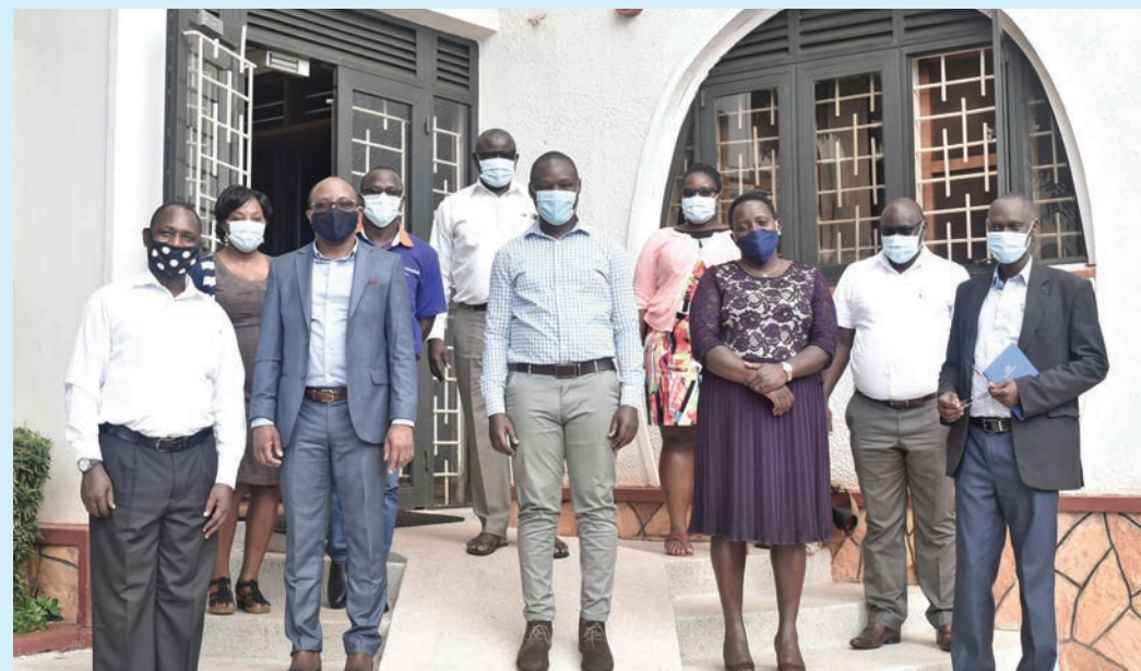
Key representatives of the Ugandan MOH, Oyam district government, Malaria Consortium, Living Goods and UNICEF after signing the MOU for Oyam district.

The partnership will help standardize the quality of care and provide government and supervisors with critical, real-time community-level data.