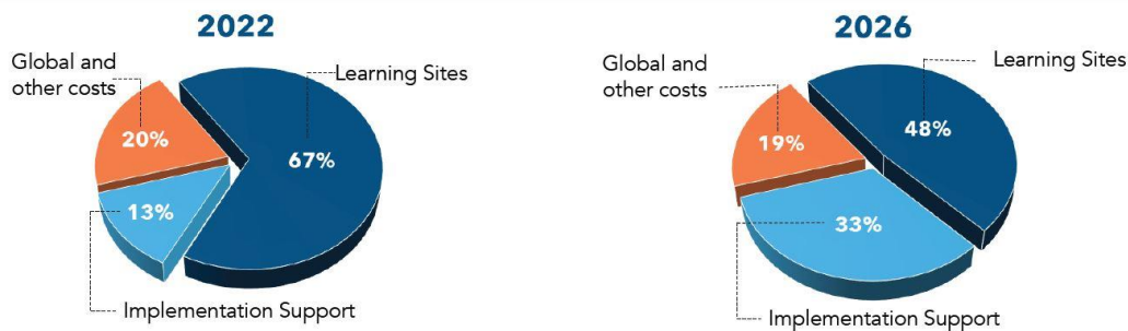
Shift Over Time in Levels of Investment across Different Modes of Support (cost to Living Goods only)